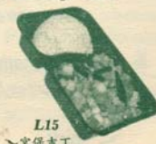
L15 ~宮保吉丁 $5.75 Kung Pao Chicken