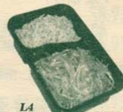
L4 三 絲 芽 菜 $4.95 Triple Delight Bean Sprouts