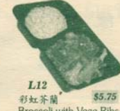
L12 彩 虹 芥 蘭 $5.75 Broccoli with Vege Ribs