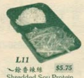
L11 ~餘香辣絲 $5.75 Shredded Soy Protein with Ginger Sauce