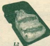
L2 三 明 治 $4.95 Vege Ham Sandwich