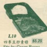
L10 四 季 豆 炒 素 條 $5.75 Stir-fry Green Beans with Vege Ribs