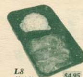
L8 鮮 竹 捲 $4.95 Bamboo Roll