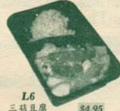
L6 三 菇 豆 腐 $4.95 Triple Mushroom with Bean Curd