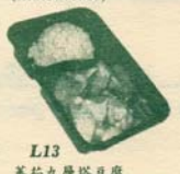
L13 蕃 茄 九 層 塔 豆 腐 $5.75 Bean Curd with Tomato & Basil