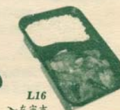
L16 ~左宗吉 $5.75 General Tso's Chicken