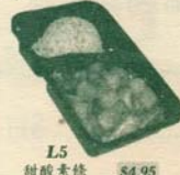
L5 甜 酸 素 條 $4.95 Sweet & Sour Vege Ribbon Delight