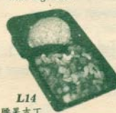
L14 腰 果 吉 丁 $5.75 Vege Chicken with Cashew Nuts