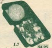
L7 ~麻婆豆腐 $4.95 Bean Curd Szechuan Style