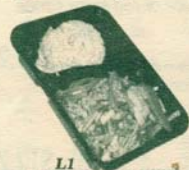
L1 ~柳角香干炒若絲 $4.95 Dry Bean Curd Delight