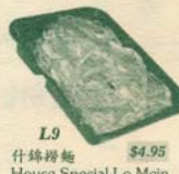
L9 什 錦 撈 麵 $4.95 House Special Lo Mein (without Rice)