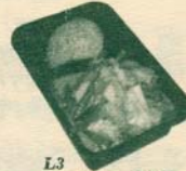
L3 ~咖哩什菜 $4.95 Curry Mixed Vegetables