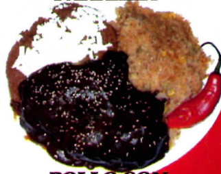
POLLO CON MOLE