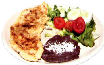
POLLO A LA PARRILLA