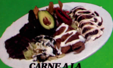
CARNE A LA TAMPIQUENA