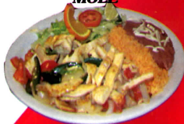
POLLO A LA MEXICANA