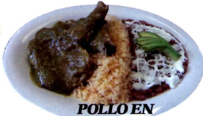
POLLO EN SALSA VERDE